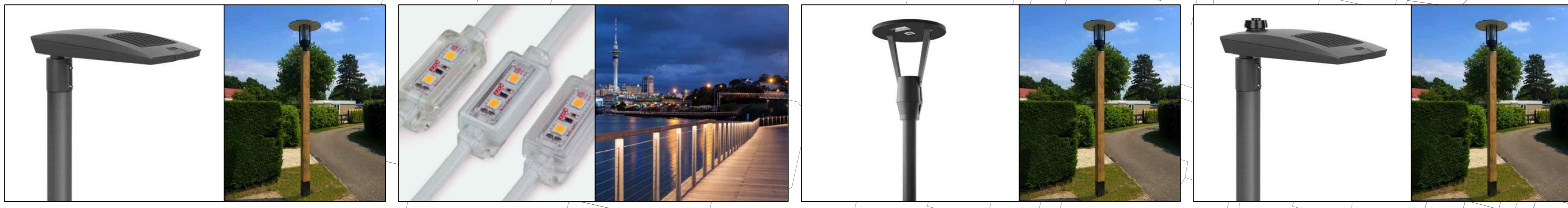
TYPE 1 KREOS SR/150 (PERFORMANCE LIGHTING) MOUNTED ON TIMBERLAB PILA POLE TYPE 2 DUO LUNA (1 MOD/M) (KROCC) TYPE 3 HEDO+FT SR/075 (PERFORMANCE LIGHTING) MOUNTED ON TIMBERLAB PILA POLE TYPE 4 KREOS SR/100 (PERFORMANCE LIGHTING) MOUNTED ON TIMBERLAB PILA POLE