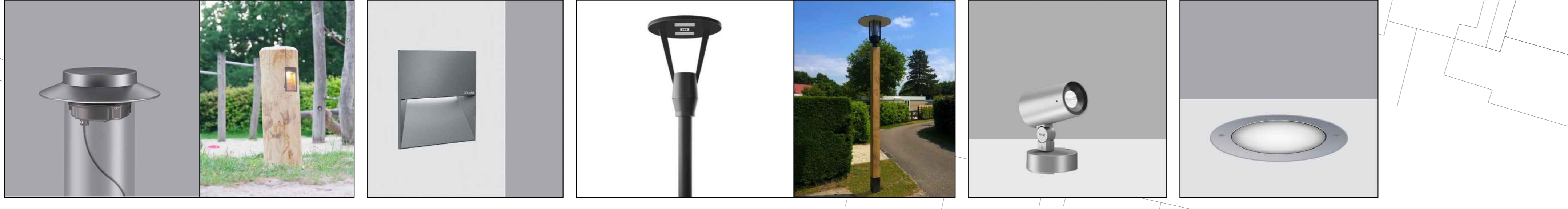
TYPE 5 HWY SUPER-COMFORT (GUZZINI) INTEGRATED INTO TIMBERLAB PIATTO TYPE 6 WALKY SQUARE (GUZZINI) TYPE 7 HEDO+FT (PERFORMANCE LIGHTING) MOUNTED ON TIMBERLAB PILA POLE TYPE 8 PALCO IN/OUT (GUZZINI) TYPE 9 LIGHT UP EARTH (GUZZINI)